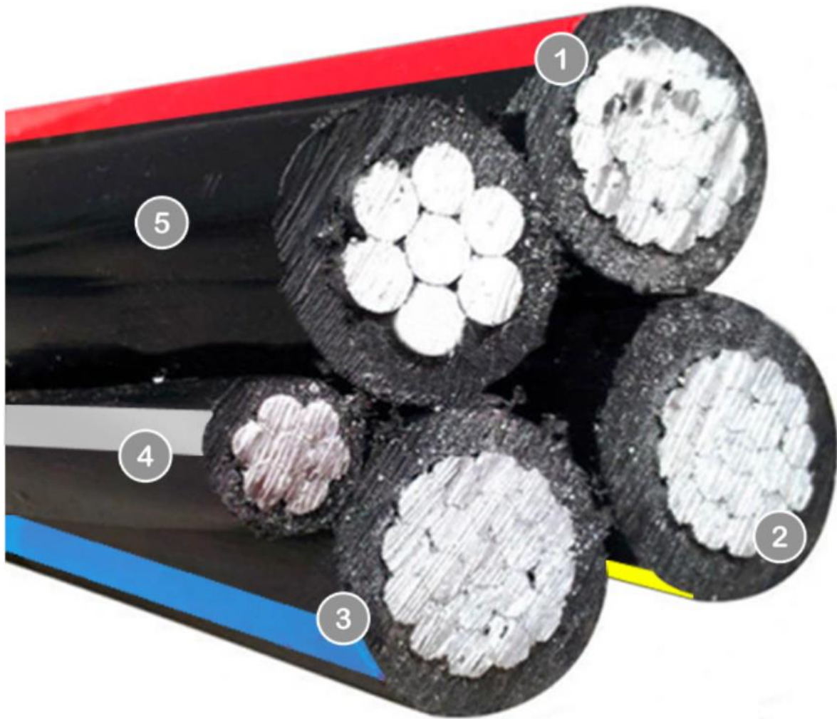
Figure 1: XLPE Insulated Aerial Bundled Conductors (ABC) 3 \times 120 + 50 + 70 \text{ mm}^2